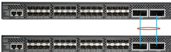
Figure 2. Cisco MDS 9134:Two Cisco MDS 9134 Switches Stacked Using 10GBASE Copper CX4